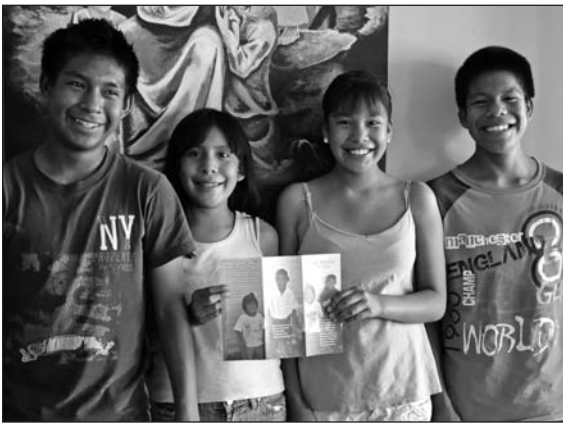
A growing familia: Pictured above, four youngsters pose with a brochure featuring a picture of themselves taken several years ago. It’s a joy to see how they have flourished.