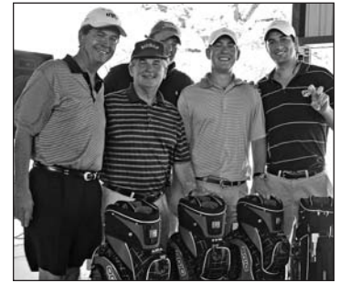
The 2011 tournament champs

Again, we offer many thanks to the wonderful volunteers, sponsors, donors, and golfers whose support made this event our best ever. There are many great pictures of the tournament on the diocesan flickr page. Find the link at fwepiscopal.org and print any you'd like.