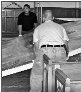
Above and below: After the linen canvas is stretched on to its frame, it is lifted into place in the niche behind the altar.

After being closed for nearly a year, Shuman Chapel at St. Andrew’s, Fort Worth, has undergone a major transformation. The original tan flagstone floor has emerged from under a layer of carpet, and two new memorial gifts have been dedicated, turning a beloved wor-