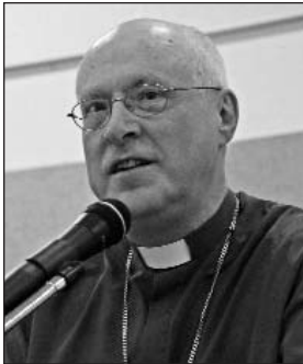
Archbishop Gregory Venables